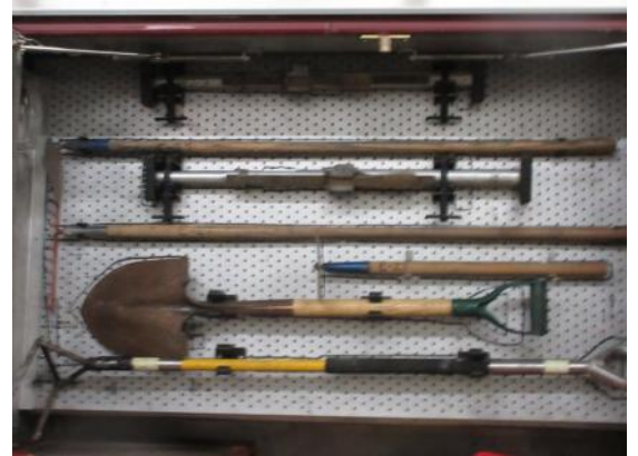
Bottom: Some tools are not marked at all