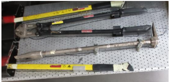
Top: Some of the id tags are rubbed off.

T here is or has been a color code in the county for each department. The purpose is to identify small equipment simply by the color painted on the tool. It has not been widely used in recent years. It seems with every large fire there are issues trying to identify the owners of the small tools. As memory serves: Black= Odessa, Yellow =Montour, Gray = Burdett, Green= Watkins. This could be inaccurate. EMO is looking to see if they can find any record of the old color code.